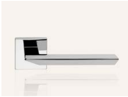
CR cromo lucido polished chrome