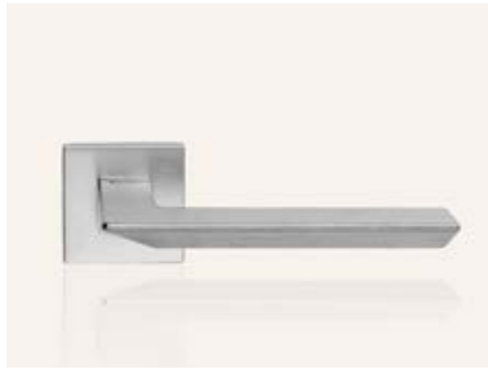
CS cromo satinato satin chrome