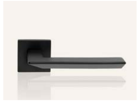
VE nero opaco matt black