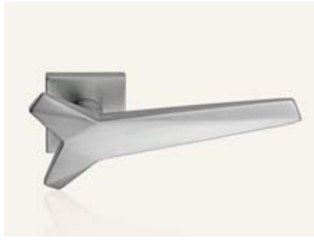
CS cromo satinato satin chrome