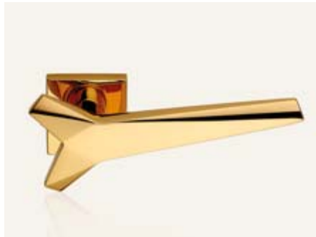
OZ oro zecchino gold plated