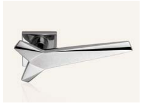
MC cromo + cromo sabbato chrome + matt chrome mix