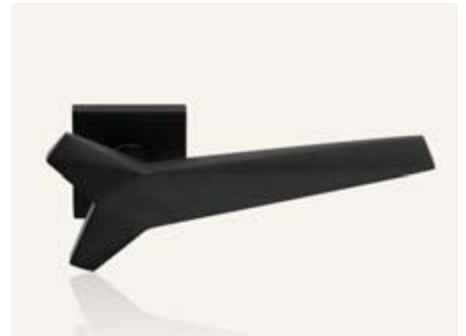
VE nero opaco matt black