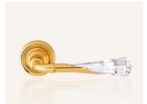
OZ oro zecchino gold plated