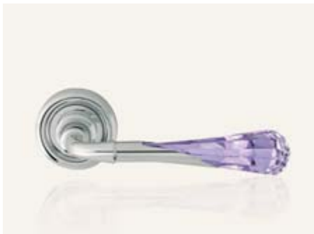
CR cromo lucido polished chrome