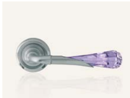
CS cromo satinato satin chrome