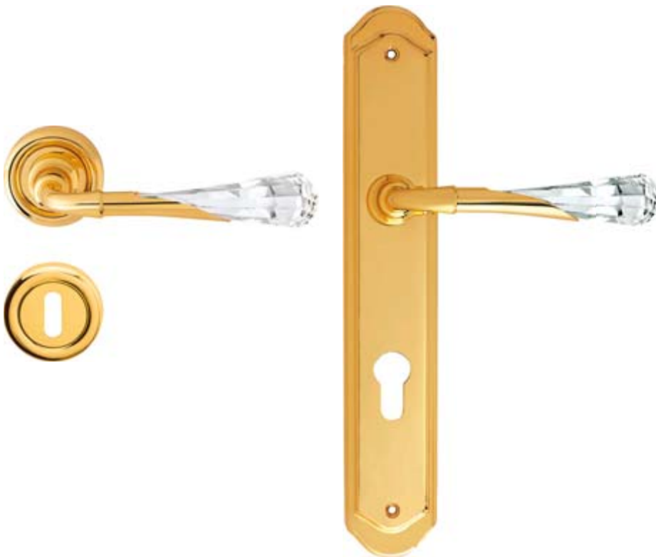
COD. 1120 RB 103