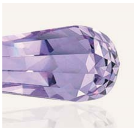
1121 swarovski viola violet swarovski