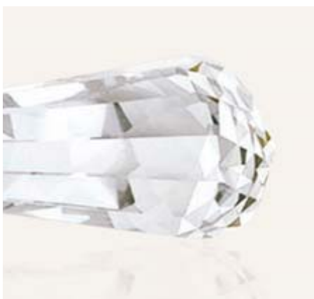
1120 swarovski cristallo crystal swarovski