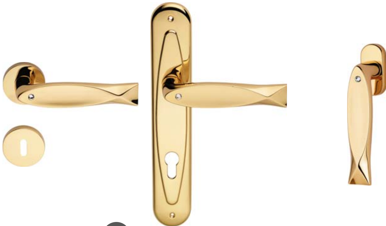
COD. 700 RB 023