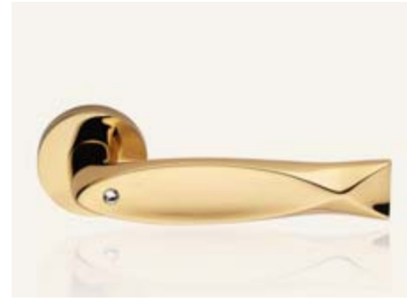
OZ oro zecchino gold plated