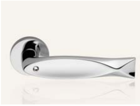
CR cromo lucido polished chrome