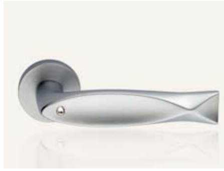
CS cromo satinato satin chrome