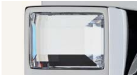
1340 swarovski cristallo crystal swarovski