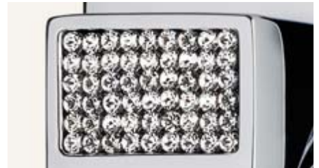
1344 swarovski mesh cristallo mesh crystal swarovski