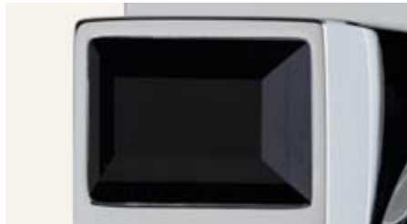
1343 swarovski jet nero black jet swarovski