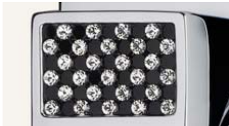
1348 swarovski black cristallo black crystal swarovski