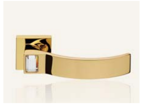
OZ oro zecchino gold plated