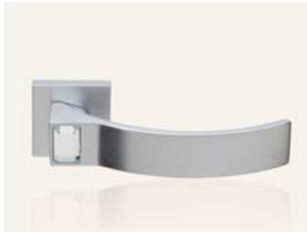
CS cromo satinato satin chrome