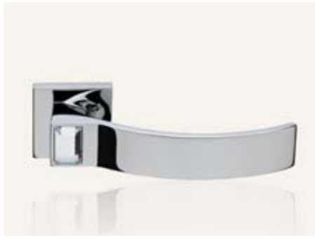
CR cromo lucido polished chrome