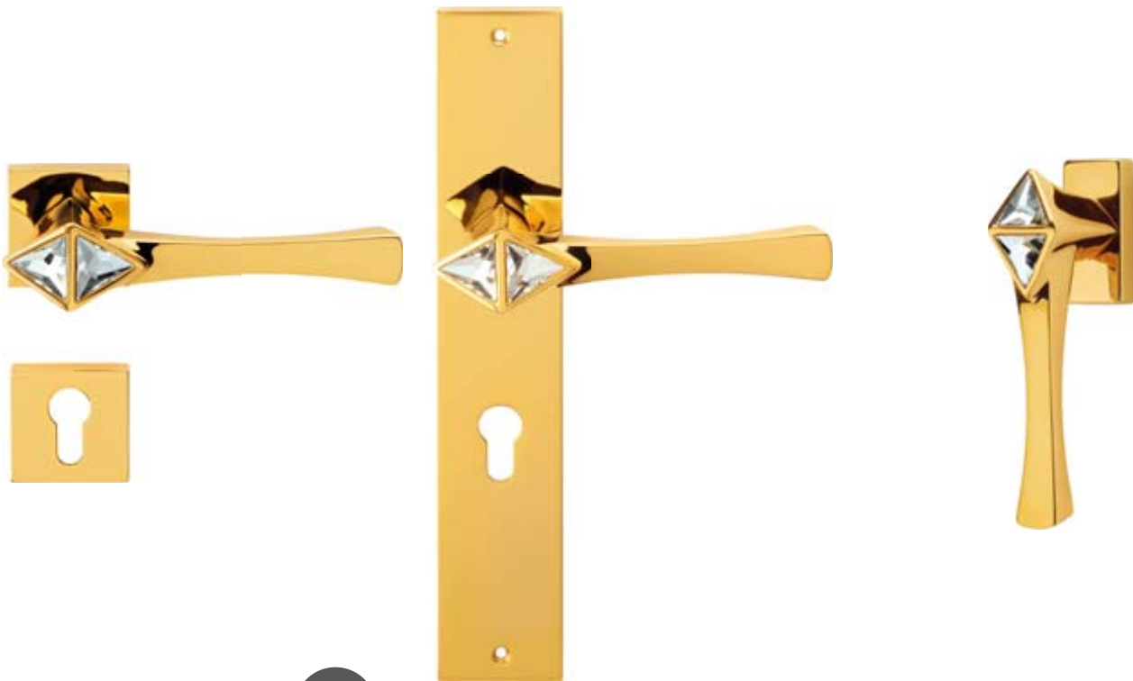
COD. 1290 RB 019