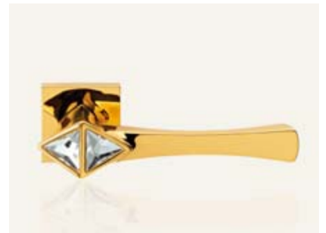
OZ oro zecchino gold plated