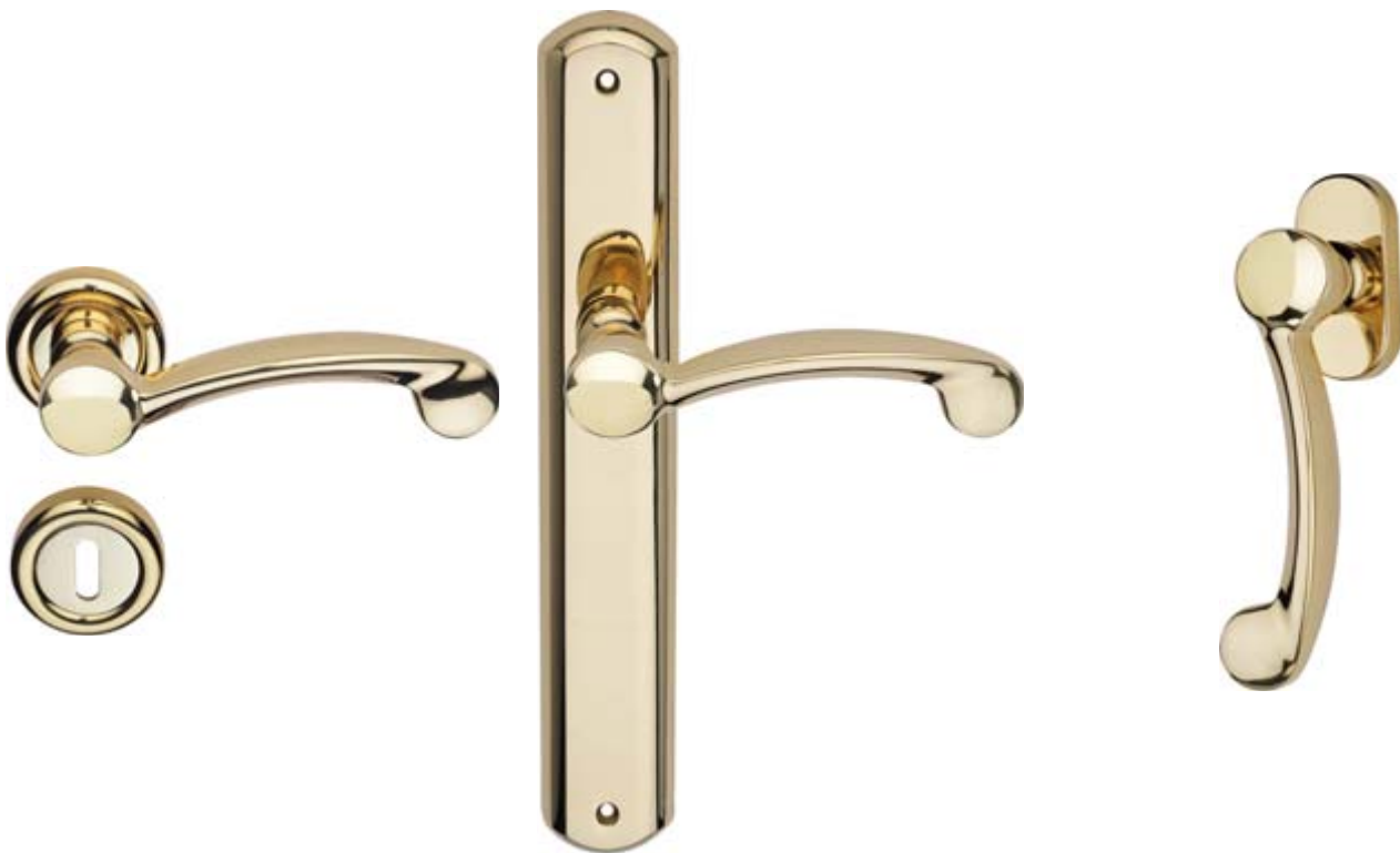
COD. 1330 RB 103