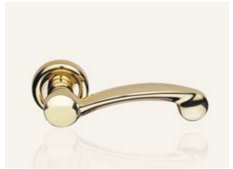
OL ottone lucido verniciato polished brass