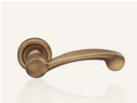
PM patiné patiné mat