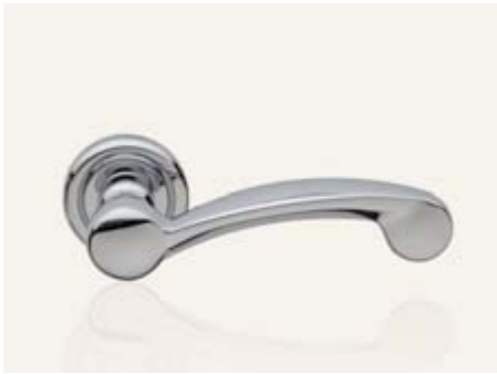
CR cromo lucido polished chrome