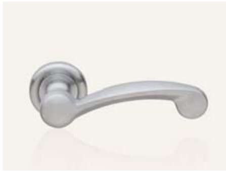
CS cromo satinato satin chrome