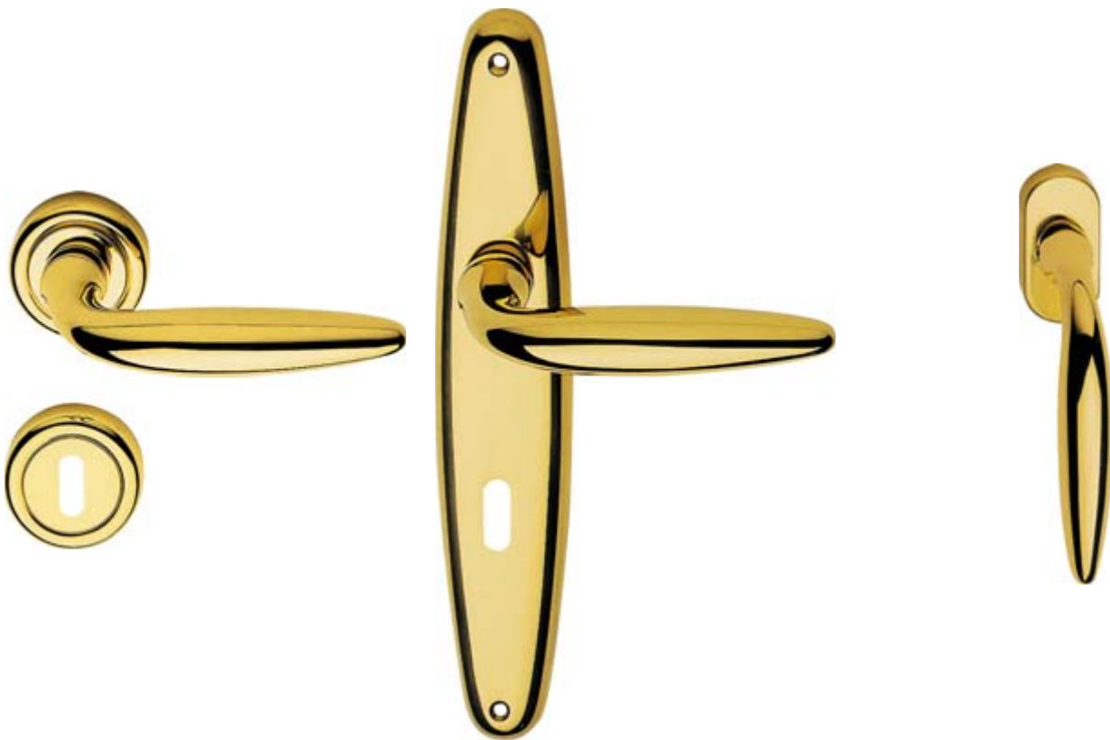
COD. 930 RB 103