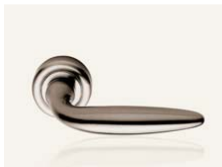
NS nickel satinato satin nickel