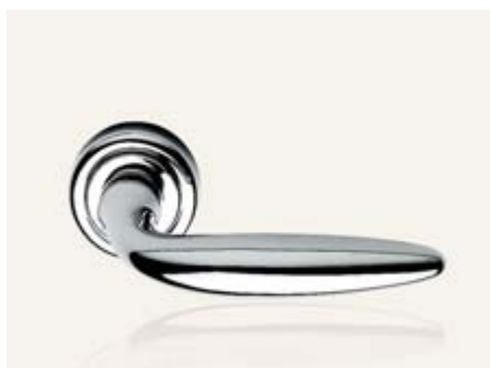
CR cromo lucido polished chrome