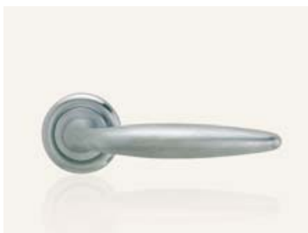
CS cromo satinato satin chrome