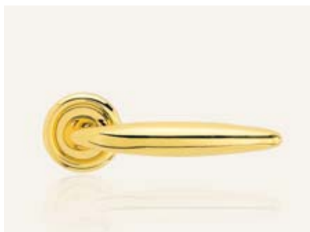
OL ottone lucido verniciato polished brass