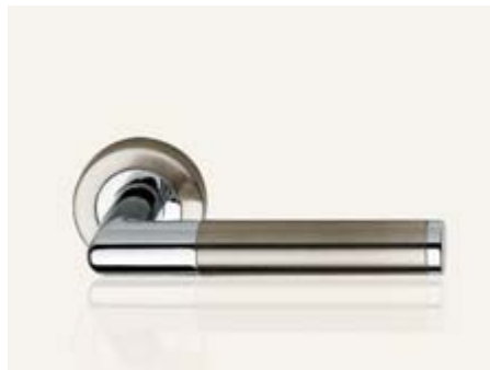
CN nickel satinato + cromo satin nickel + polished chrome mix