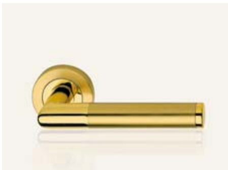
OT ottone satinato + ottone lucido satin brass + polished brass mix