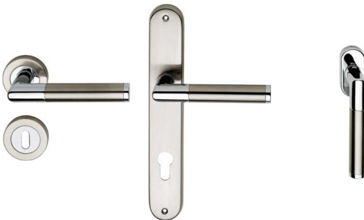
COD. 940 RB 102