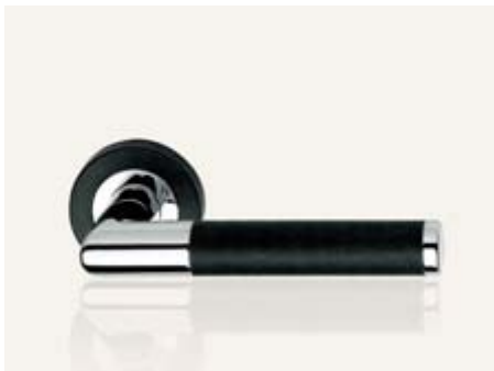
CE nero opaco + cromo matt black + polished chrome mix