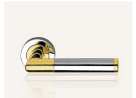
OC cromo + ottone lucido chrome + polished brass mix